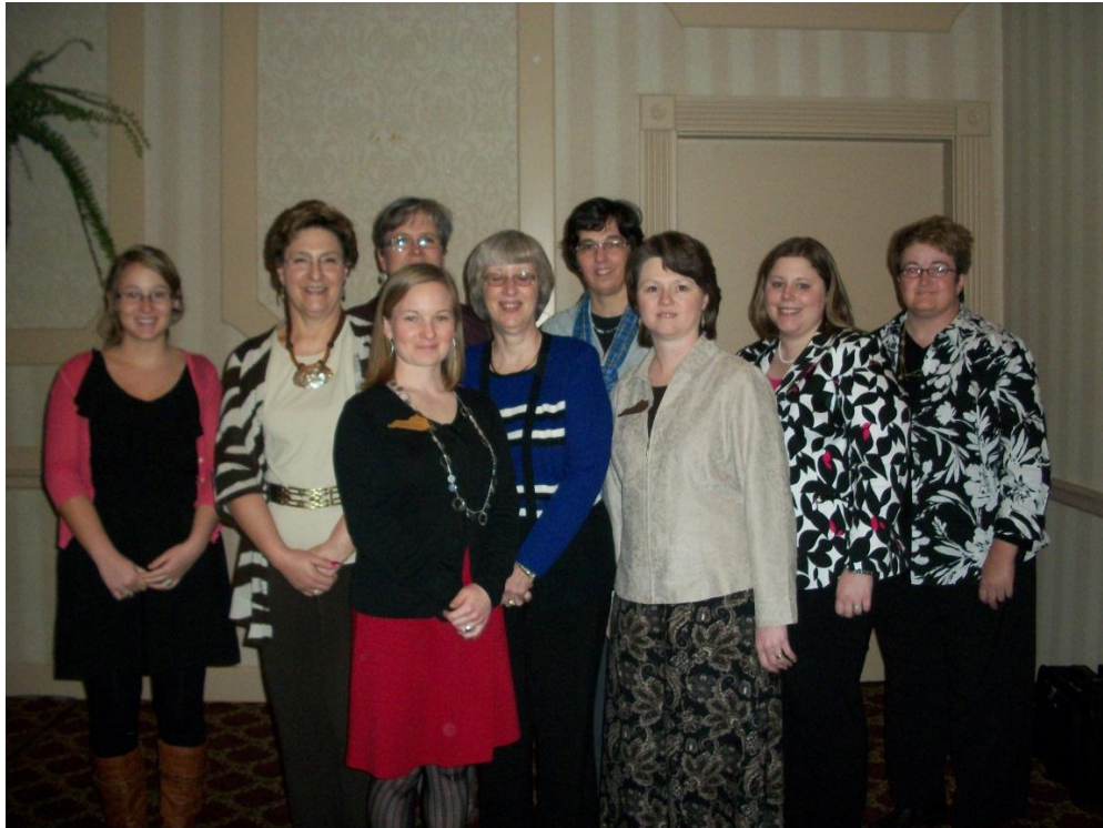
2011-2012 KAFCS Executive Board