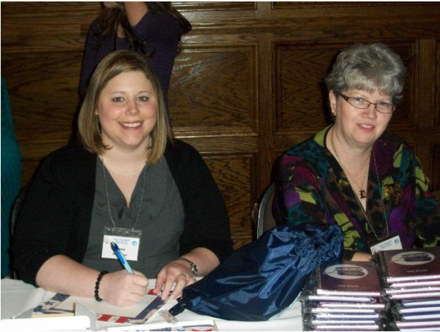
KAFCS Service Project-Packed H.E.R.O. bags for Operation Military Kids.