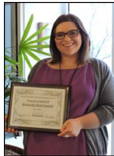
Friend of KAFCS Ky Beef Council