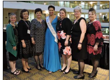
Miss Kentucky with KAFCS Officers